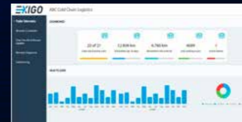
Advanced telematics included as standard