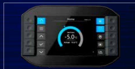
High resolution graphical user interface